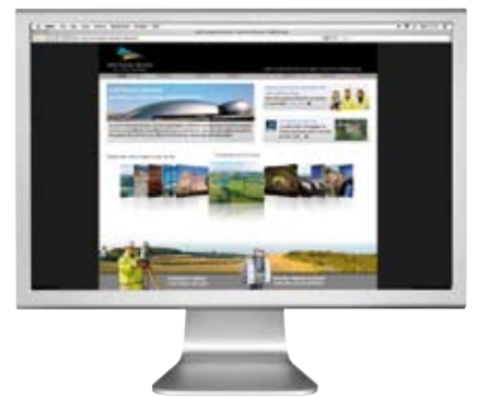
L&M Survey Services' new look website

This month sees the launch of L&M's extensive new website. Designed by Ayr-based Ocean Agency, the site provides a full overview of the company, from services and case studies, to news and job vacancies, equipment and policies.